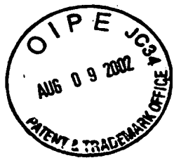
IMAGE FORMING APPARATUS AND CARTRIDGE DETACHABLY ATTACHABLE THERETO